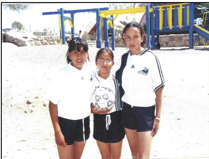
Members of Colegio La Esperanza Girls Soccer Team 2002